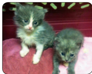
Binky and Blue

survival and level of adoptability. We received a litter of kittens that were rescued from Orange Cove. Mother cat was killed, leaving four, 4-week old kittens. The kittens are Lynx Point Siamese, highly adoptable.