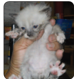
Blizzard's sibling Sansei

We must also factor in the likelihood of