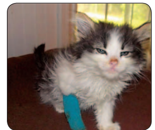
Rescue Kitten has injury

Fortunately we buoyed by the numerous humanitarian individuals whose hearts are as big as the moon . These are the people who step up and do the right thing even though it is rarely easy or convenient. Without these extraordinary people, the Cat House wouldn't be able to save anywhere near the number of animals that we do. Monetary donations are always needed but the donation of your time and effort is a gesture that can never be measured in mere dollars and cents.