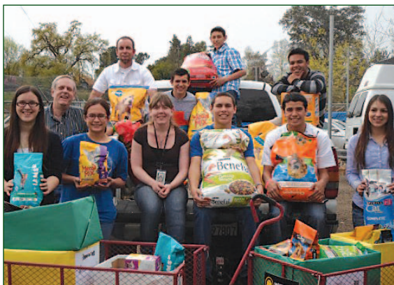
Dinuba FFA Donation