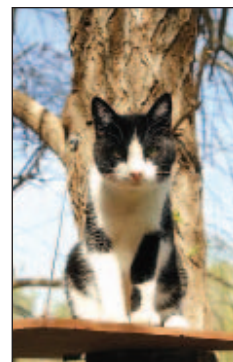
Cat enjoys new perch