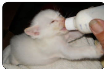
Orphaned Lynx Point Blizzard