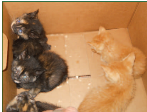
Rescued alley kittens

Lynea had one final thought regarding this article; "If everyone would just clean up their own block like these people did, we could maybe make a difference in the lives of all of these abandoned domestic pets".