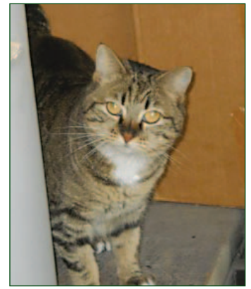
Lucky now a healthy adult