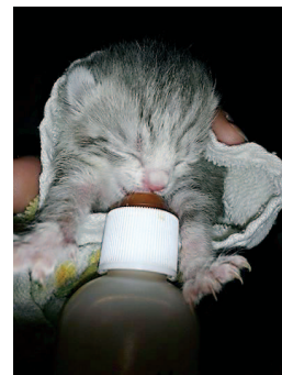
Feeding time before...