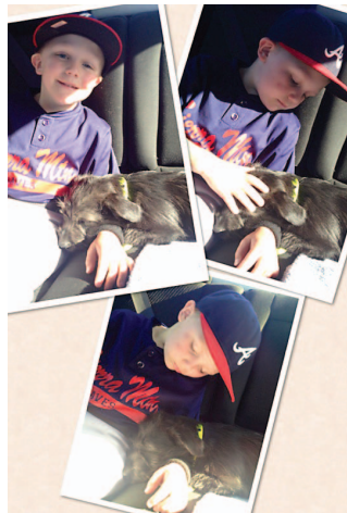
Jesse and his boy, Cash

"Jesse", along with another dog, was pulled from a large hole near a canal bank