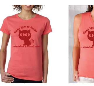
Order Cat House on the Kings Apparel & Merchandise@ www.cathouseonthekings.com/shop

The Cat House on the Kings Feline Rescue 7120 South Kings River Road Parlier, CA 93648