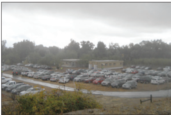
They came despite the rain

We've had a really long run of good weather for our past open house fundraisers. This time Mother Nature threw a curve ball at us. The heavens opened up and to say it was a deluge of rain would be like saying the ocean is a little bit wet. While California desperately needs