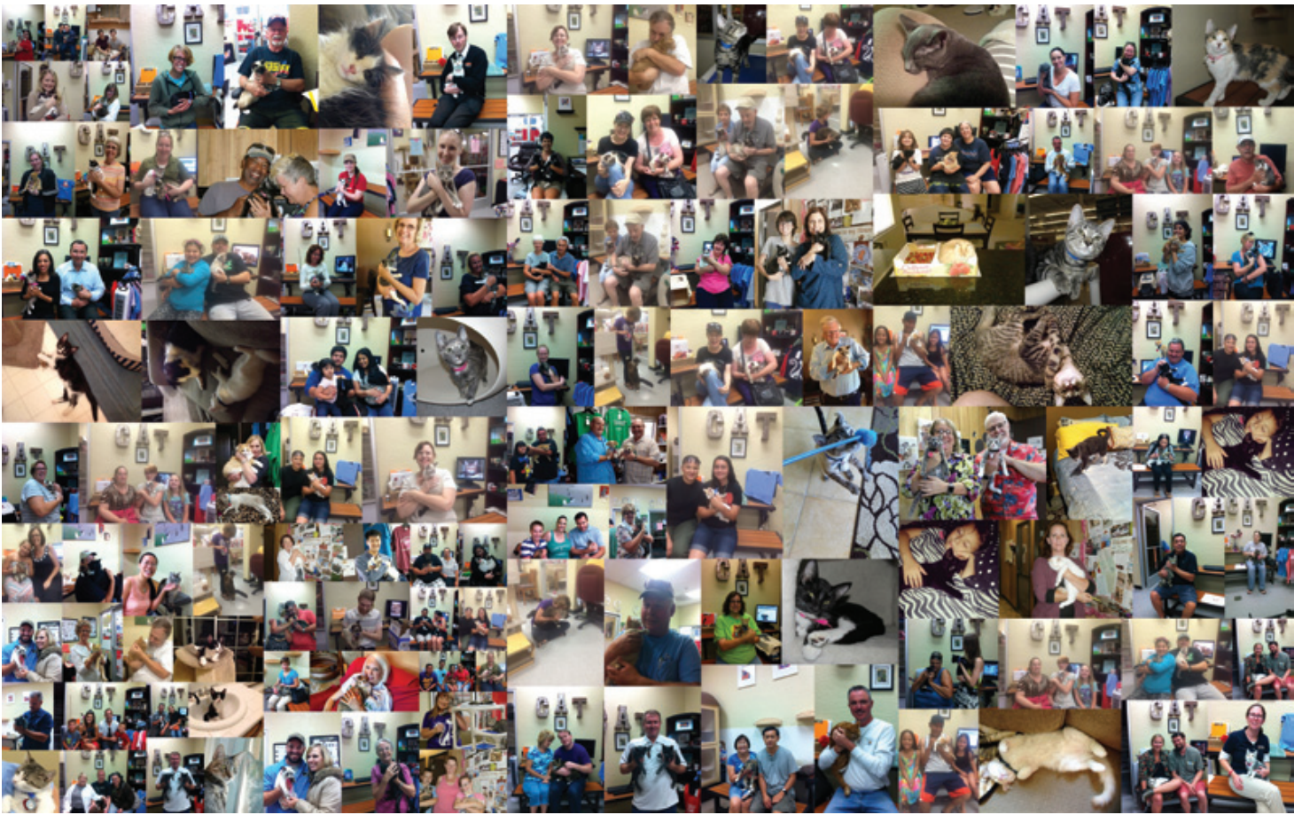
Take a look at some of the 939 cats and kittens adopted out this year!