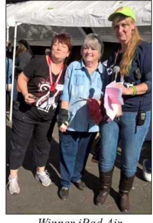
Winner iPad Air

performance running the snocone booth. We would be remiss to not thank The Cat House on the Kings employees and volunteers who labored so hard to ready the grounds and set up the boutiques. We wish to thank everyone who came out to support The Cat House.