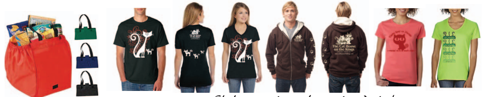
Check out our selection of new styles and colors!