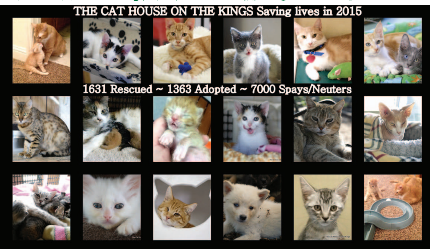
Help Us Save More Precious Lives!

HELP US WIN $20,000 The Cat House on the Kings is in a VERY close contest to win the $20,000 Grand Prize in the Shelter Challenge that runs through December 20th. We know that during this busy time of the year, stopping once a day to vote from your computer or phone can be hard to remember, but we wanted to explain what difference it makes for our hungry cats and kittens. First place is $20,000 while second place is $5,000. That $15,000 difference represents a LOT of spays and neuters, a LOT of vaccinations, it helps pay vet bills, and it helps provide warmth and comfort for kitties in need. Please vote DAILY through December 20th. The easiest way to find us in the Shelter Challenge is by using our zip code, 93648. You can vote once a day from a computer or a smart phone. Vote daily at www.shelterchallenge.com If you are on Facebook, please visit The Cat House on the Kings Facebook page and share our posts about this contest on your Facebook page ... and ask your family and friends to vote!