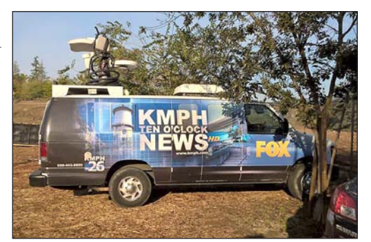
KMPH Fox 26 visits The Cat House

Fox 26 sent out Jim De La Vega to help us publicize our fall open house on their morning show. On December 15th,