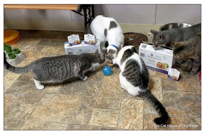
The cats give their seal of approval

Thanks to all your votes, The Cat House on the Kings is one of five non-profits who won $50,000 of high quality cat food. Applaws USA makes all natural, additive-free pet foods. Applaws products are available online and also at your local Petco. We are very grateful for your faithful voting that enabled us to win all this amazing cat food.