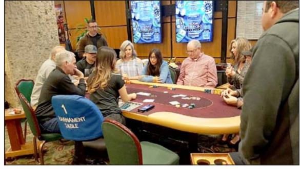
The Winners Table