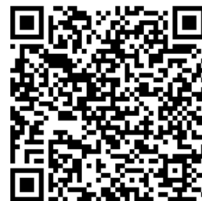
Scan the QR code or text CATHOUSE to 53-555 to donate to The Cat House.

Thank you for helping address the pet over-population!